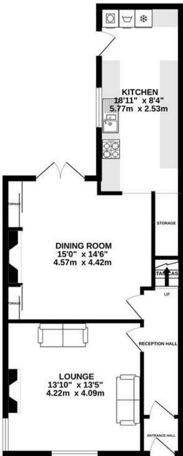
GROUND FLOOR 629 sq.ft. (58.4 sq.m.) approx.