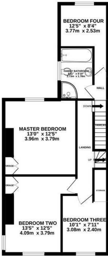
1ST FLOOR 592 sq.ft. (55.0 sq.m.) approx.